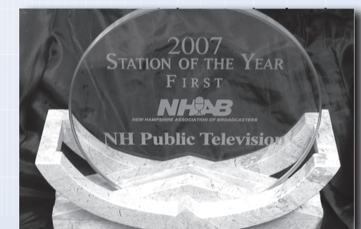
In recognition of our excellence in broadcasting and public service, the NHAB named NHPTV 2007 Station of the Year.